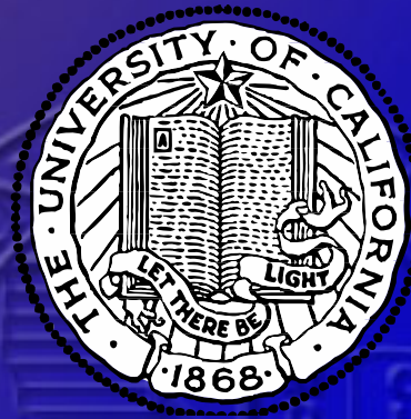
University of California