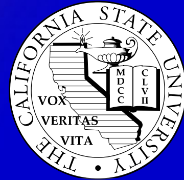
California State University