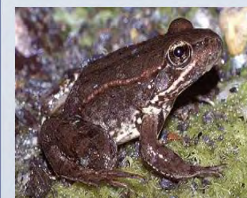
California red-legged frog ( Rana aurora draytonni )

Listed as threatened by the U.S. Fish and Wildlife Service, these are born in fresh water streams, where they spend their first 1-3 years of life before emigrating to the ocean. Steelhead return to their native fresh water stream to spawn.