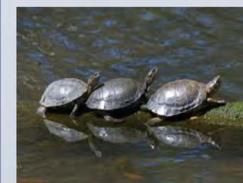
Western pond turtles ( Clemmys marmorata )

This frog is listed as threatened and is protected by federal and California law. The main cause of the population decline is habitat loss and destruction, and the introduction of predatory species.