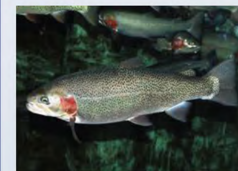
Steelhead trout ( Oncorhynchus mykiss )

Listed as threatened by the U.S. Fish and Wildlife Service, these are born in fresh water streams, where they spend their first 1-3 years of life before emigrating to the ocean. Steelhead return to their native fresh water stream to spawn.