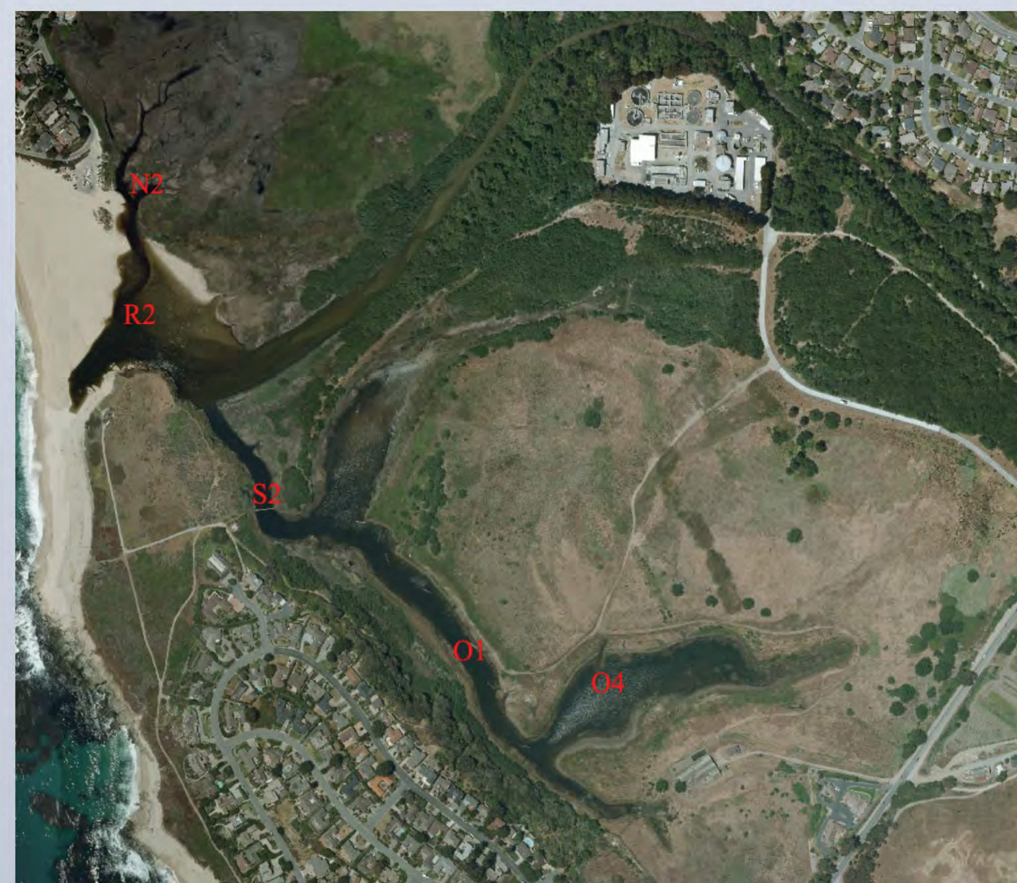
Location of sampling sites in the Carmel River Lagoon

Lagoon habitats associated with streams and rivers along the central California coast have been found to be important for juvenile steelhead rearing prior to migration into marine waters. Juvenile steelhead living in coastal lagoons were found to have faster growth rates and larger size at ocean entry when compared to juveniles that reared further upstream within the freshwater reaches, as well as a high return rate of adult steelhead for breeding (Hayes et al. 2008). Several studies have attributed the success of lagoon-reared salmon to a complex invertebrate prey community and the availability of a transition zone where fish can adjust to increasing salinity prior to migrating out to sea (Bond 2006). As the increased flow from the wet season fills the lagoon, the sandbar, which separates it from the ocean in drier months is eroded and eventually breached, allowing the smolts to move out to sea. This seasonal cycle depends upon sufficient fresh water flows and no interruption from artificial breaching of the lagoon in order to provide these habitat benefits. The goal in this study was to examine the availability of good water quality habitat for juvenile steelhead trout ( Oncorhynchus mykiss ) within the Carmel River Lagoon (CRL) under current management practices.