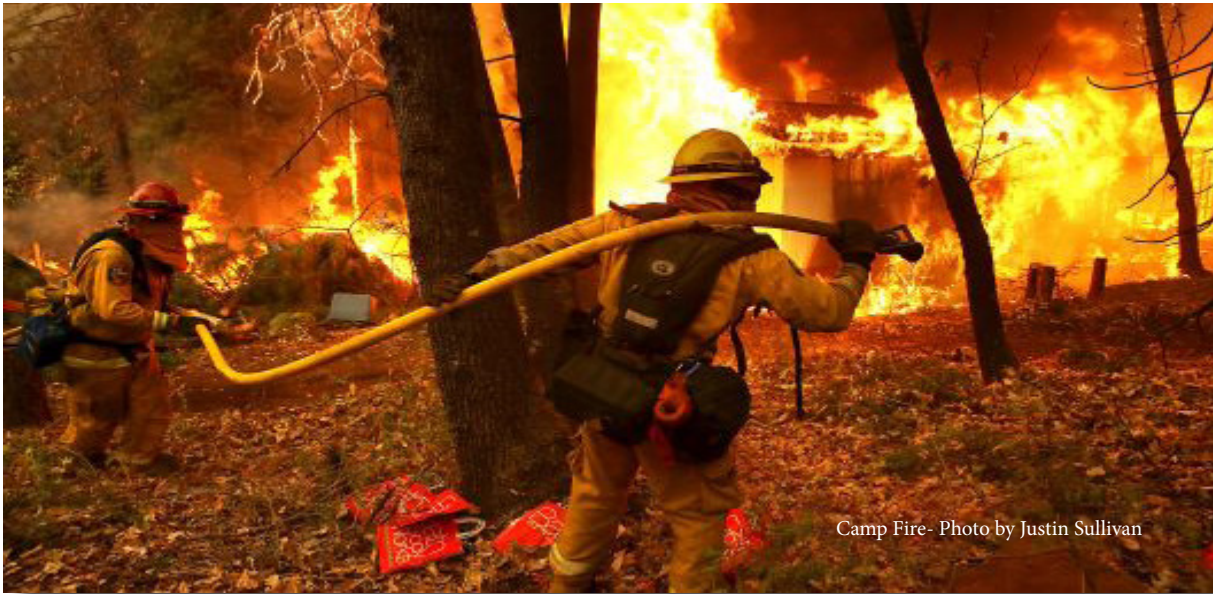
Camp Fire