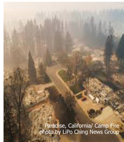
Paradise, California/ Camp Fire