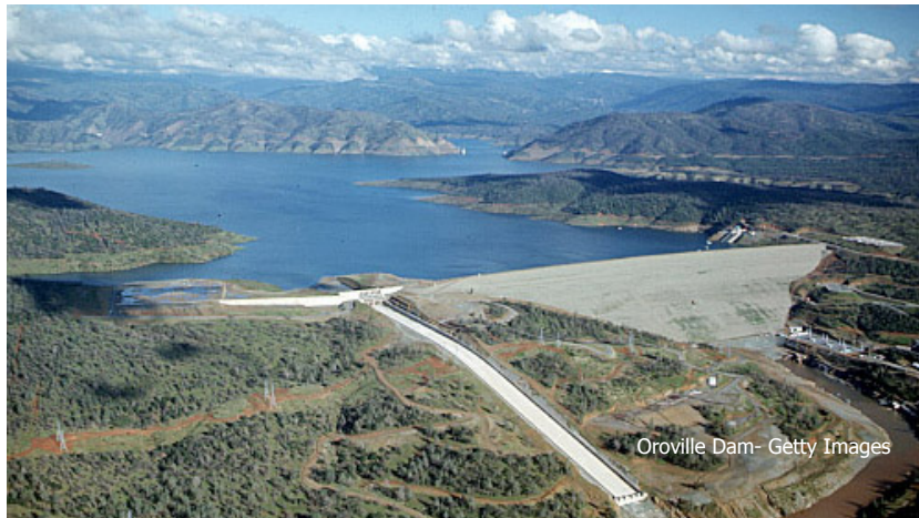
Oroville Dam