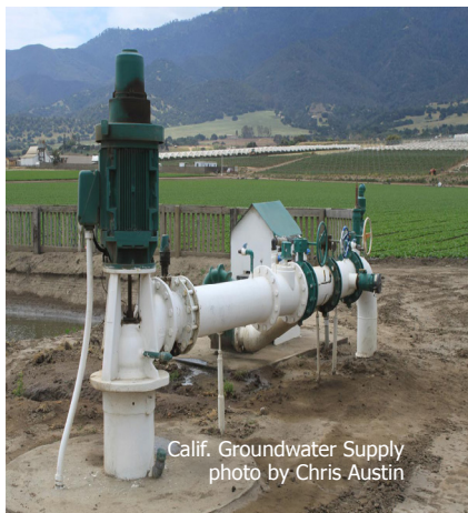
Calif. Groundwater Supply